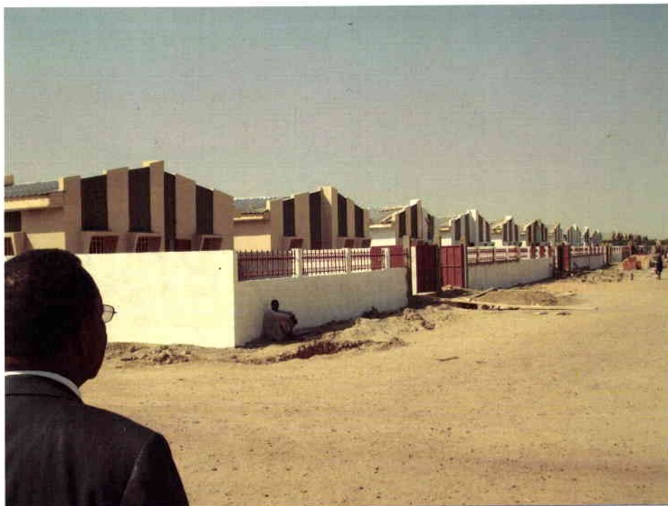
Type of houses under construction in N'Djamena, Chad.

14. According to the project team, the increase in construction costs resulted in high house prices, which the low income group could not afford. Therefore, the Government of Chad decided to change the prospective final beneficiaries from the low to the middle and high income population. The project team explained that the proceeds from the sale of plots in Patte D'Oie would then be used to purchase other plots which could be used to construct houses for the low income population. OIOS was not able to obtain evidence of any formal endorsement from UN-HABITAT on the change of plan as stated in the project document. Without an agreement between the Government of Chad and UN-HABITAT with a clause requiring prior approval of amendments, there was a risk that UN-HABITAT could be involved in projects that are not necessarily in line with its mandate, exposing UN-HABITAT to reputation risk should projects fail.